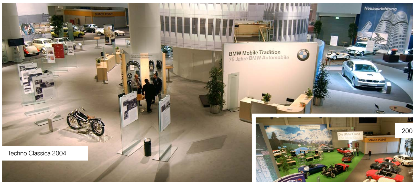
Techno Classica 2004

Subsequent shows in the classic period were characterised by 'side by side' formations with the by now independent BMW works show and the presentation of the Clubs. The year 1997 was a particularly remarkable one as BMW had chosen to focus on motorcycles this time. Only a large, Le Mans-style tyre arch separated the BMW zone from the Club areas, and in the latter, a number of then active clubs recreated the historic Nürburgring driver's camp as a backdrop to the club theme of motor sport. Once again, it was performed and financed by the club's own man and women power, however, with considerable assistance from sponsors.