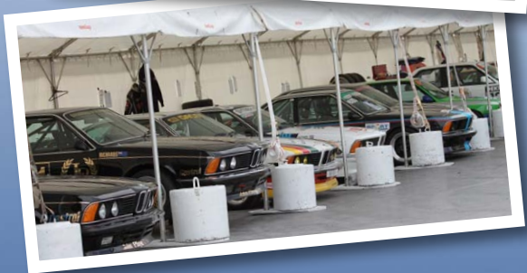
The cars on track represented the success of BMW's motorsport history and also included cars from the BMW Classic collection in Munich.