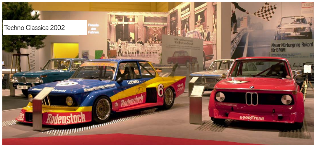
By this point, all of Hall 12 – the 'BMW Hall' – had been taken over by BMW. The main attraction, however, is the exhibition replica of one of the four cylinders in the BMW tower.

The fittings were classic and practical. It was even possible to divide off a catering