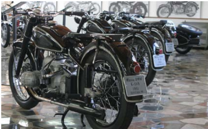
Simply fascinating – Motorcycle museum of Curitiba

Being a great success of concurrency and results, where friendship emerged instantly and spontaneously, six countries came together: Argentina, Brazil, Chile, Costa Rica, Mexico and Uruguay.