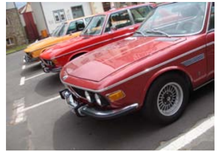
BMW classic cars of the 60's and 70's at the "Neue KlasseTreffen" in Eisenach

You will also find a current calendar of events on our website at www.bmw-clubs-international.com