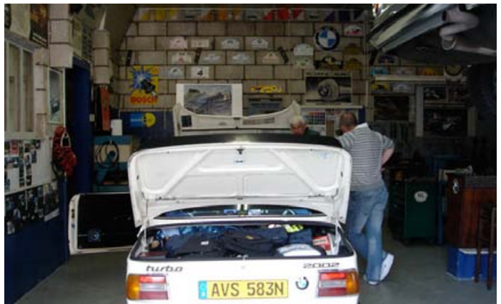
Wim's dream garage with a lot BMW 02 memorabilia

about more turbos. Sunday was checking out time, but Dutch 02 enthusiast Wim offered to take us to his garage and look at my turbo. We followed Wim and then pulled into his drive way to be greeted by a massive old BMW sign on the side of a barn. Inside is Wim's workshop which is a dream garage. He has lifting hoists, pits, a floor you could eat your dinner off, wall to wall BMW 02 memorabilia, all the old BMW diagnostic equipment and a bar! How cool is that?