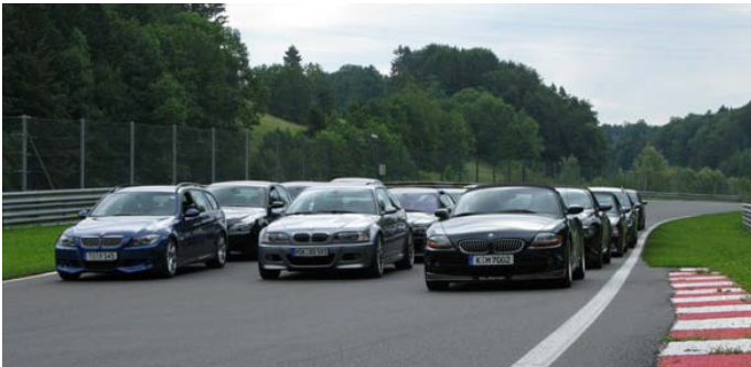
Prior to the start of the obligatory starter lap at the race track

It is now customary for the weather to have a positive impact at this summer event on the beautifully located Salzburgring. Though it was cool and rainy for days before, the clouds cleared on Saturday morning and temperatures climbed to over 25 degrees. So there was plenty of reason to be in a good mood and run a few hot laps on the circuit.