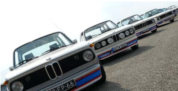
What an impressive view – the BMW 2002 cars of the club members

On the first day we had a busy schedule so we didn't really have the time to look at the car. On the Friday we drove out to the Zuiderzee Museum ( www.zuiderzeemuseum.nl ) via the E22/A7, a road that runs right through the North Sea for approximately 15 miles. It's a strange feeling like driving across the sea. On one side you have the North Sea and on the other a massive man-made lake.