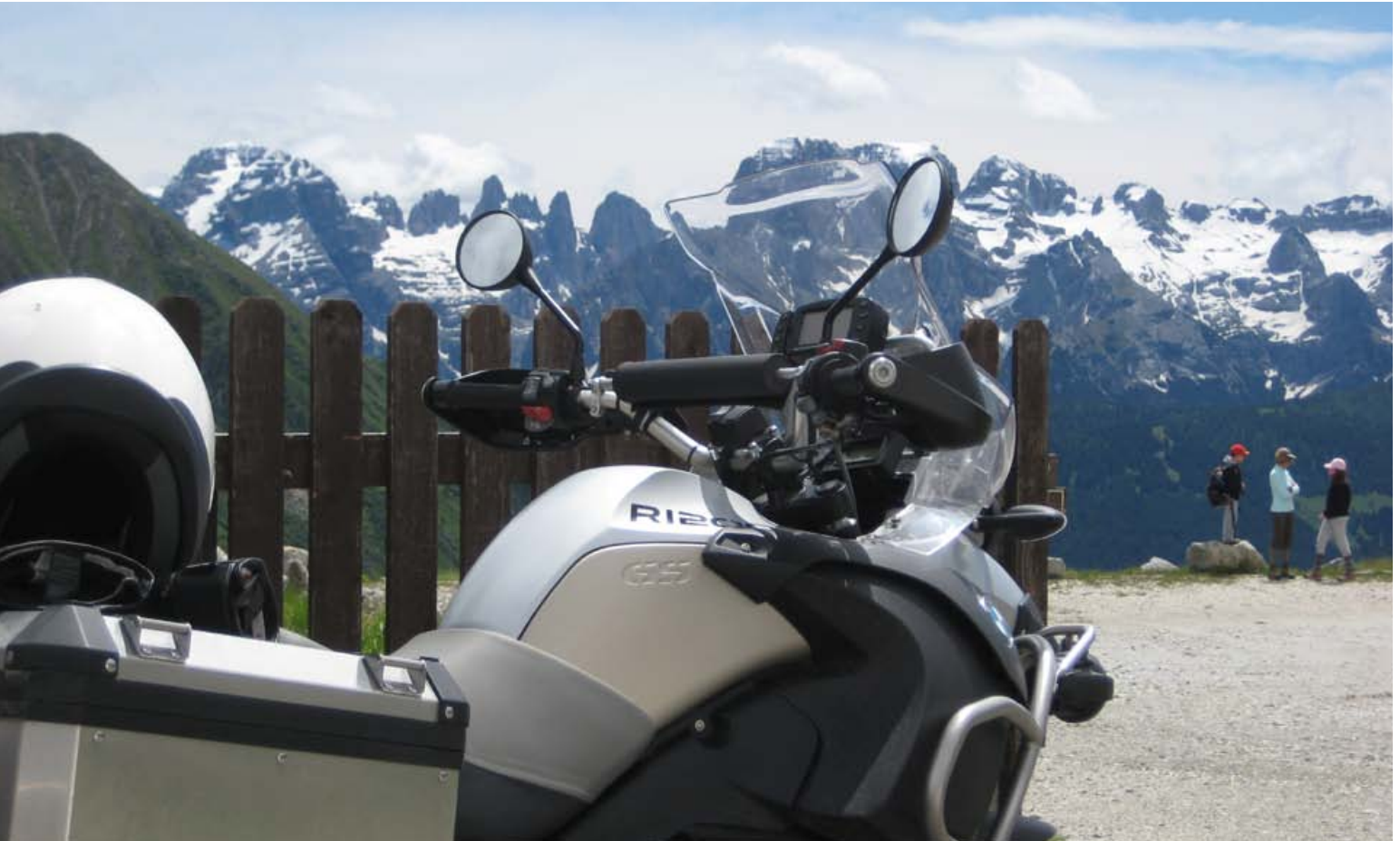
Austria - with its beautiful countryside a dream for motorcyclists

BMW Clubs International Council Newsletter