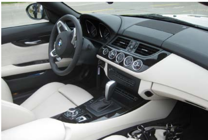
BMW Z4 sDrive 35i with 306 bhp and a torque of 400 Nm

After this introduction and a cup of coffee, the group went to the vehicles and it was time to start the ride in the new BMW Z4.