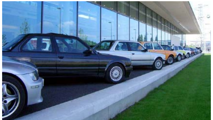
Imposing presentation of the participants automobiles

We set off again next morning. Travelling via Wuppertal and the Neandertal valley, we arrived at the BMW sales subsidiary in Düsseldorf at midday, where we were given a warm reception by the Classic Center team. After taking refreshments, admiring the new BMW Z4 and taking a special little test, we set off once again into the region, among other things passing the Gartzweiler lignite mine. Coming from the deep south of Germany, we couldn't help but be struck by this gigantic destruction of cultivated land for the purpose of generating electrical current.