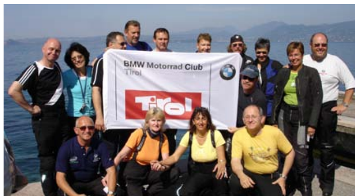
The club members enjoy being on tour together – both in summer and in winter

It was not long before I had gathered together a small group of BMW motorcycle enthusiasts. The first meeting was held in September 1998, and the BMW Motorrad Club Tirol was born.