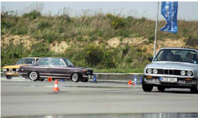
The participants had a lot of fun during the driver training course

After a short briefing, the driver training course began. Right through to the afternoon we slammed on the brakes, cranked the steering wheel and swerved our way around the track like there was no tomorrow. Refreshments were served in between – after all, those driving classic cars without power steering needed to recharge their batteries once in a while! Since the water used to sprinkle the grounds was hard, the cars were given a good wash afterwards.