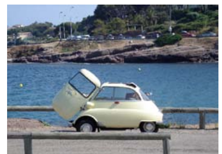
With the Isetta from Paris to southern France