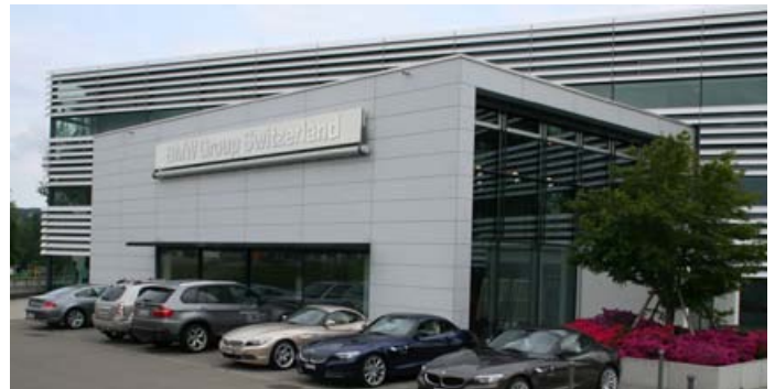
The brand new BMW Z4 in front of the BMW Group Switzerland

400 Nm at 1,300-1,500 rpm. This enables breathtaking acceleration from the very lowest engine speeds. The engine sound is something you have to experience for yourself: your heart instantly skips a beat. Gears are shifted in a fraction of a second by means of a 7-speed dual clutch transmission. Driving dynamics control permits three different vehicle set-ups: the settings Normal, Sport and Sport+ allow the accelerator pedal curve, engine management system and the DSC set-up to be altered. The sDrive 30i has 258 bhp and 310 Nm and the sDrive 23i has 204 bhp and 250 Nm of torque.