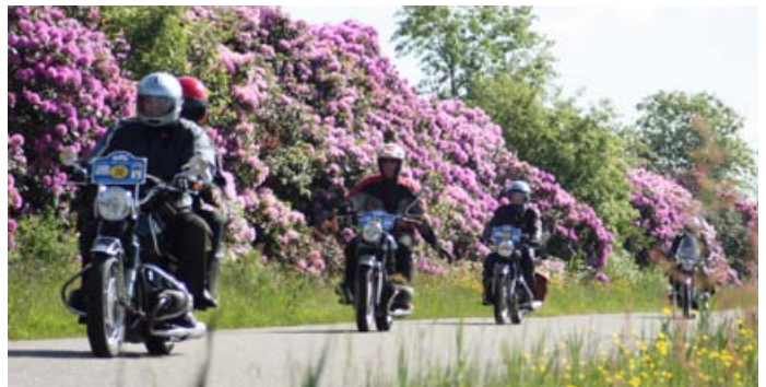
Rolling BMW Museum on the so-called German Fehn Route

Accompanied by the trumpeting orchestra of the induction tract at the rear, we glide along the so-called German Fehn Route on a band of asphalt which glimmers in the sunshine, passing dikes, meadows, hedge banks, protected moor areas and water courses. We cross navigable canals on historic folding bridges, the smooth surface of the water reflecting the BMW classic vehicles as they pass.